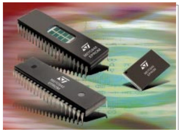
New 64 Mbit range of 5V EPROMs

Each new process includes several photolithographic innovations to achieve better electrical performance.